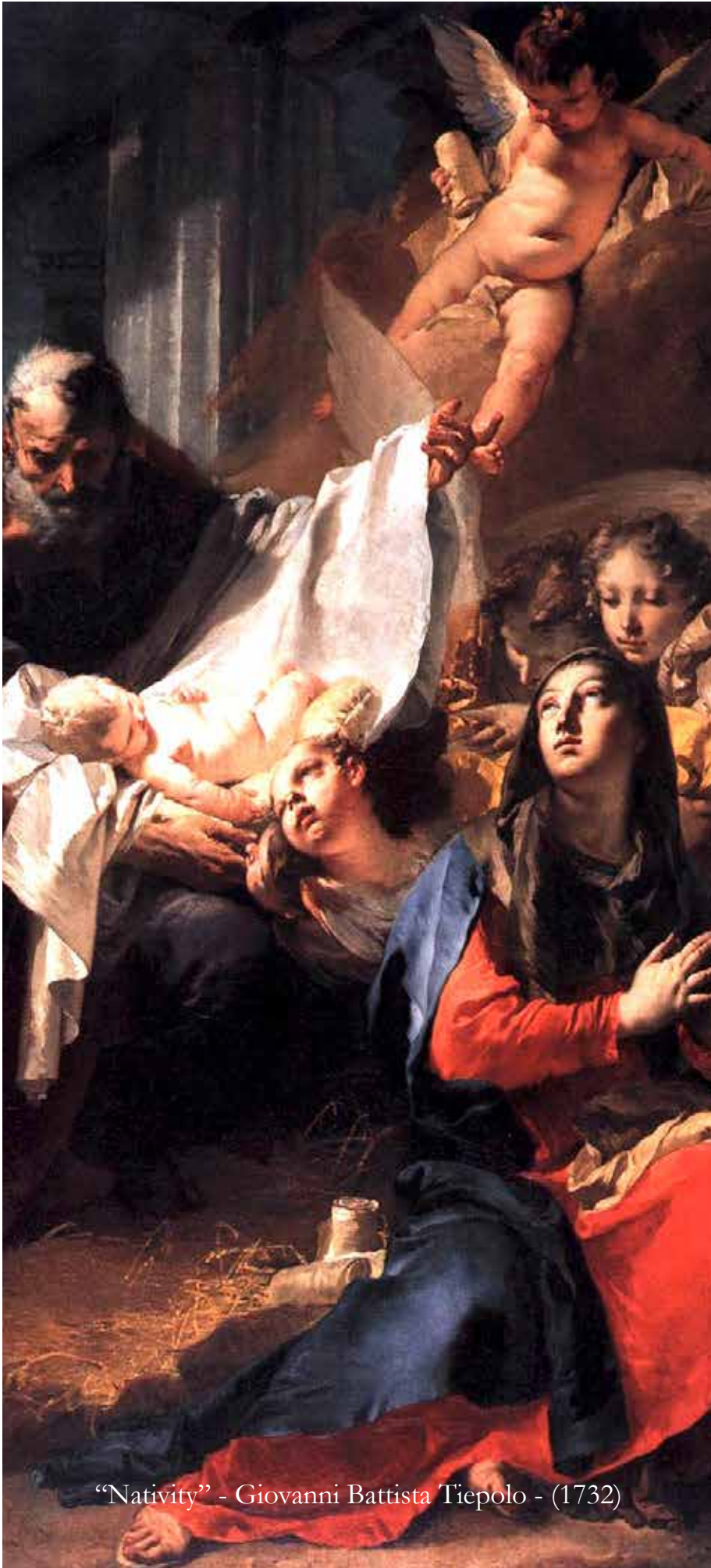
“Nativity” - Giovanni Battista Tiepolo - (1732)

Other volunteers came to last Saturday's working bee, sweeping and dusting, polishing pews, putting up decorations and getting the church ready for Christmas Day. Yet others will be singing in the choir at our Christmas services, or serving in the sanctuary, or reading from the Holy Scriptures, or preparing the pageant for Christmas Eve Children's Mass.