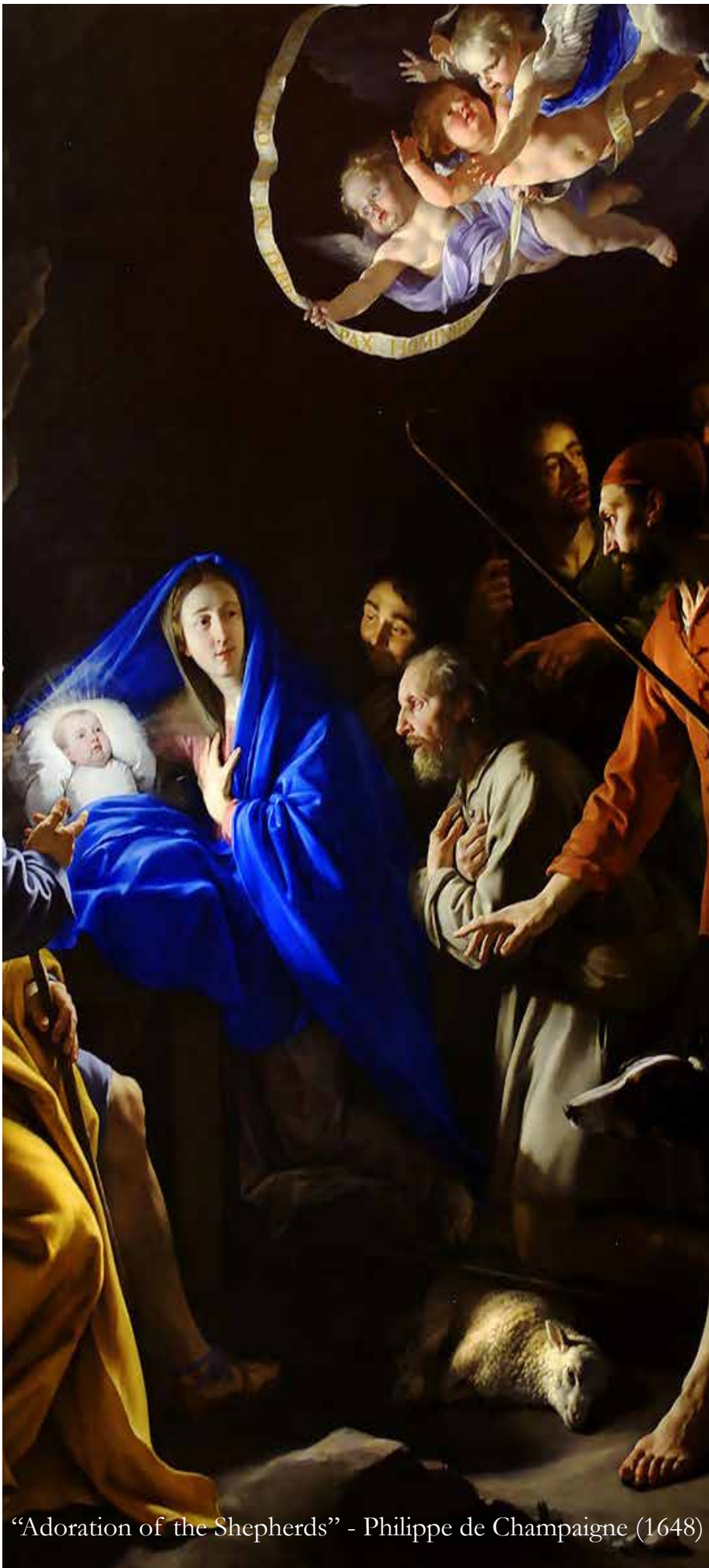
“Adoration of the Shepherds” - Philippe de Champaigne (1648)