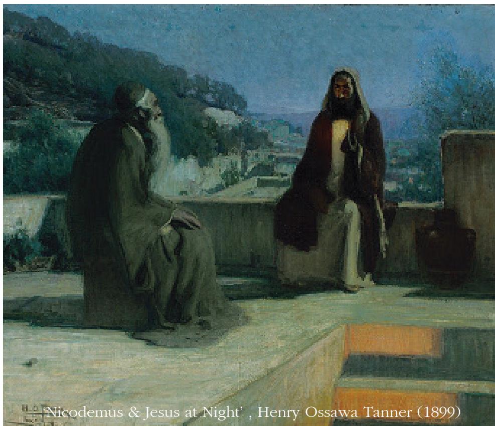
Nicodemus & Jesus at Night' , Henry Ossawa Tanner (1899)