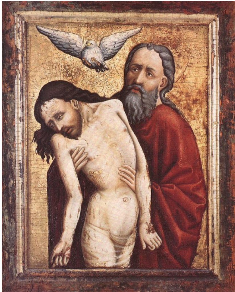
Unknown Hungarian artist, "Holy Trinity" (c. 1450)

Diocese of Melbourne - Anglican Church of Australia Parish Church of the City since 1846