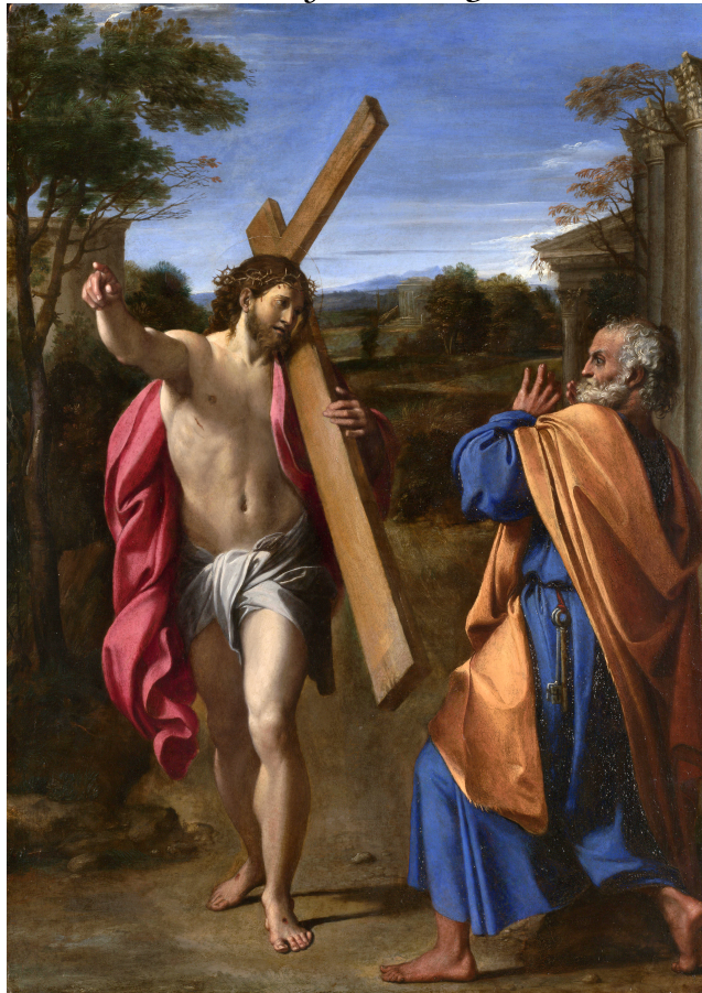
Annibale Carracci: Domine Quo Vadis?

Diocese of Melbourne - Anglican Church of Australia Parish Church of the City since 1846