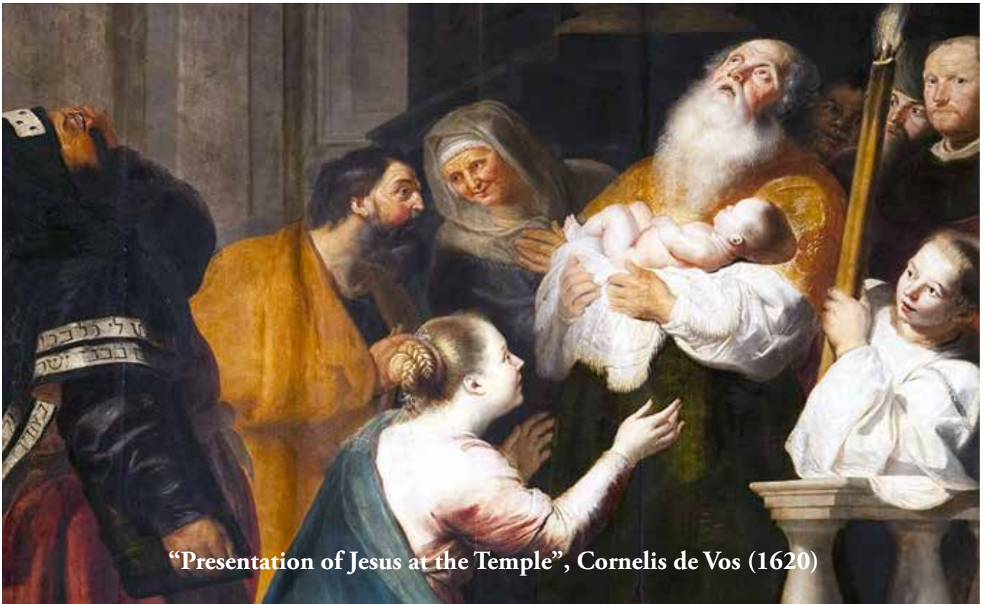
“Presentation of Jesus at the Temple”, Cornelis de Vos (1620)