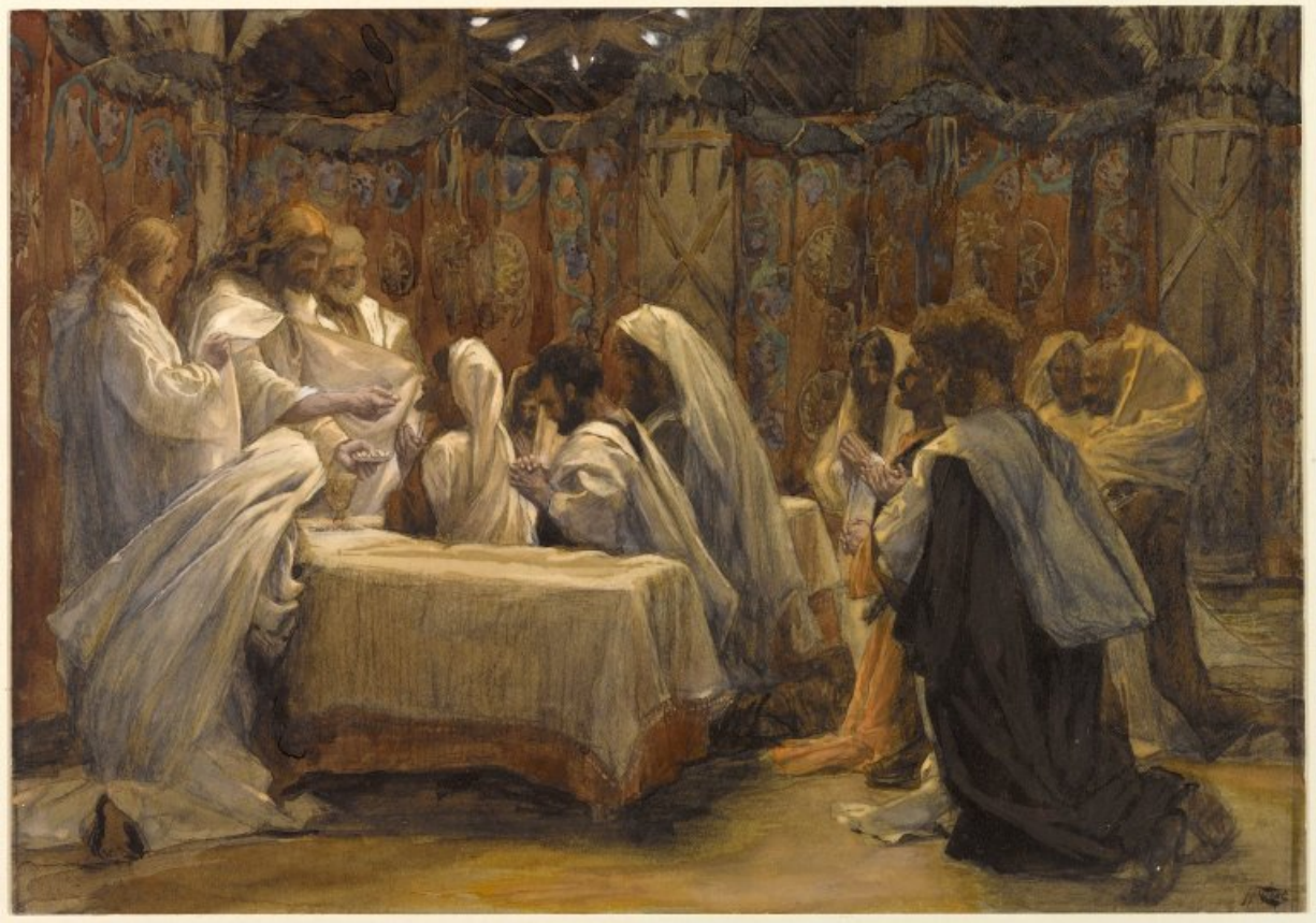
James Tissot " The Communion of the Apostles " (c.1886-94)

Diocese of Melbourne – Anglican Church of Australia Parish Church of the City since 1846.