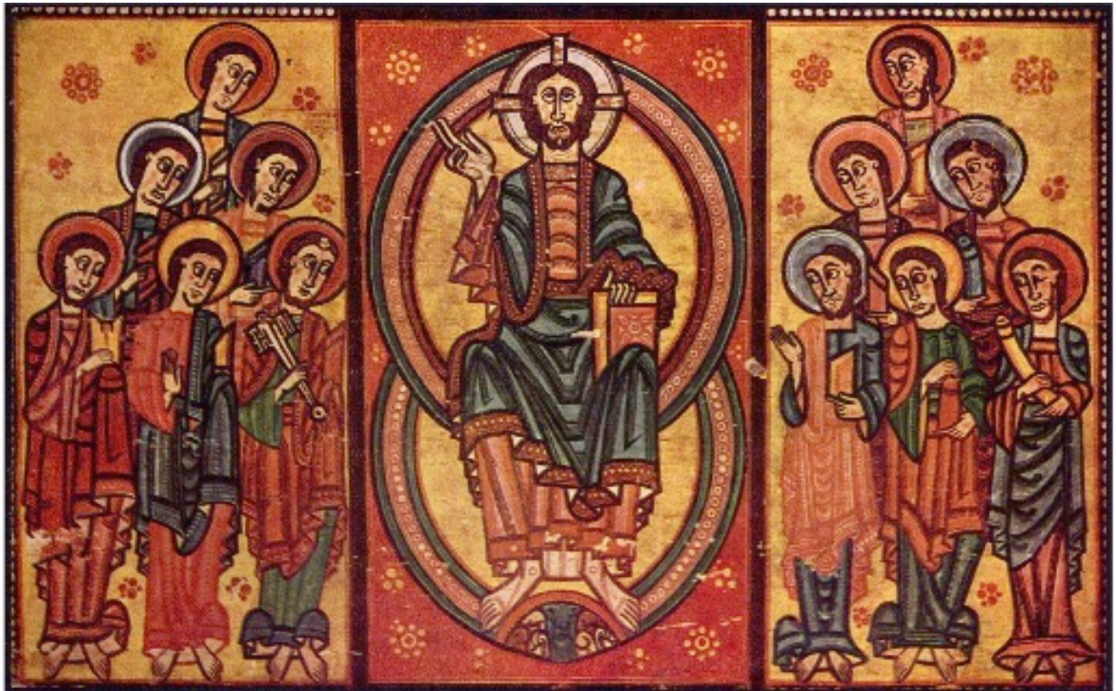
Altar frontal from La Seu d'Urgell or of the Apostles - Anonymous (c. 1125-50)