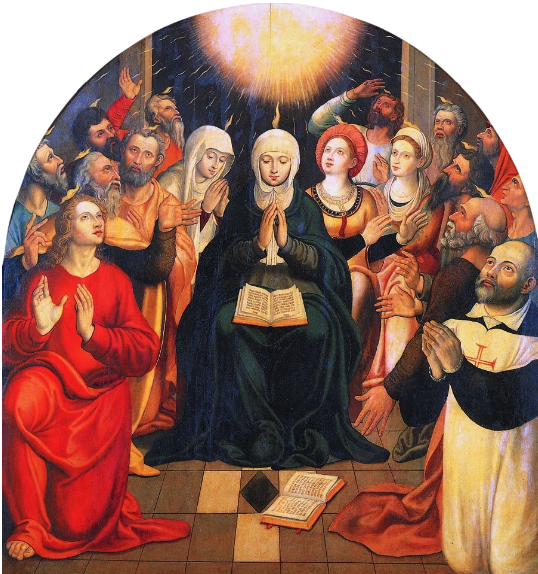
“Pentecost” (c. 1550)

Diocese of Melbourne - Anglican Church of Australia Parish Church of the City since 1846