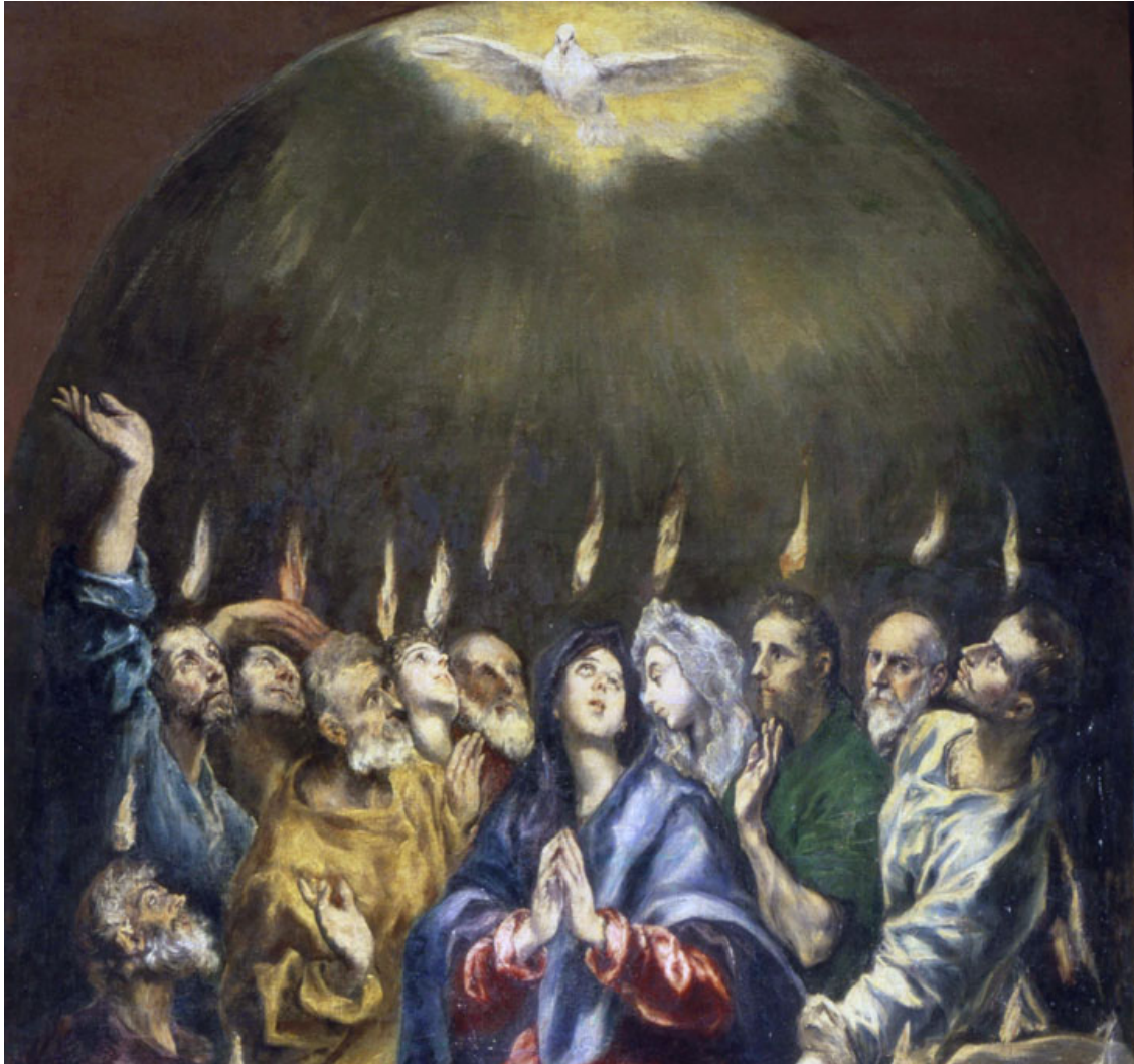
El Greco (1541 – 1614) Pentecost c. 1600