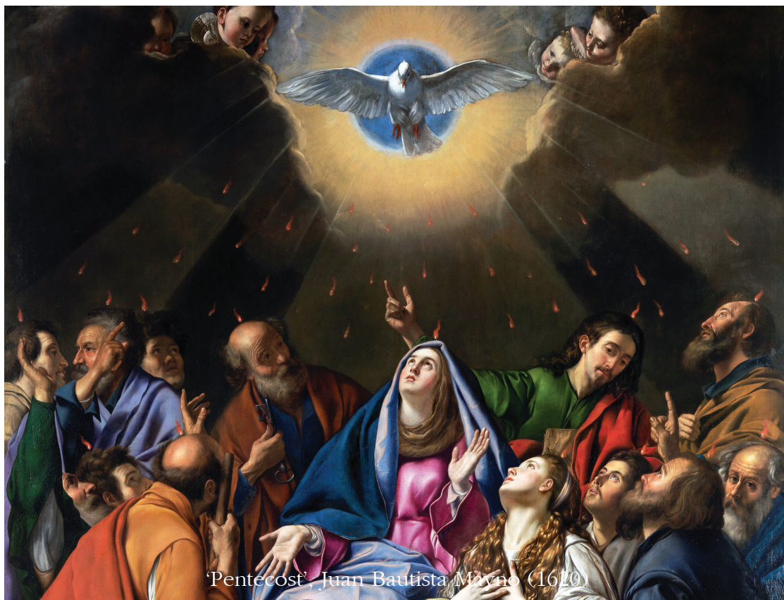
'Pentecost', Juan Bautista Maíno (1610)