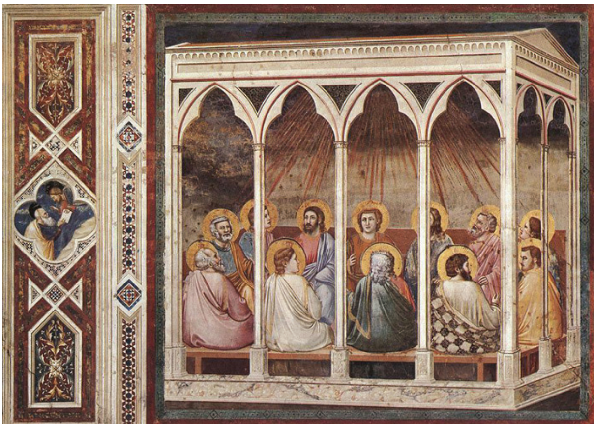
‘Scenes from the Life of Christ: Pentecost’, Giotto di Bondone (1304-06)

It was evening on the day Jesus rose from the dead, the first day of the week, and the doors of the house where the disciples had met were locked for fear of the authorities. Jesus came and stood among them and said, “Peace be with you.” After he said this, he showed them his hands and his side. Then the disciples rejoiced when they saw the Lord. Jesus said to them again, “Peace be with you. As the Father has sent me, so I send you.” When he had said this, he breathed on them and said to them, “Receive the Holy Spirit. If you forgive the sins of any, they are forgiven them; if you retain the sins of any, they are retained.”