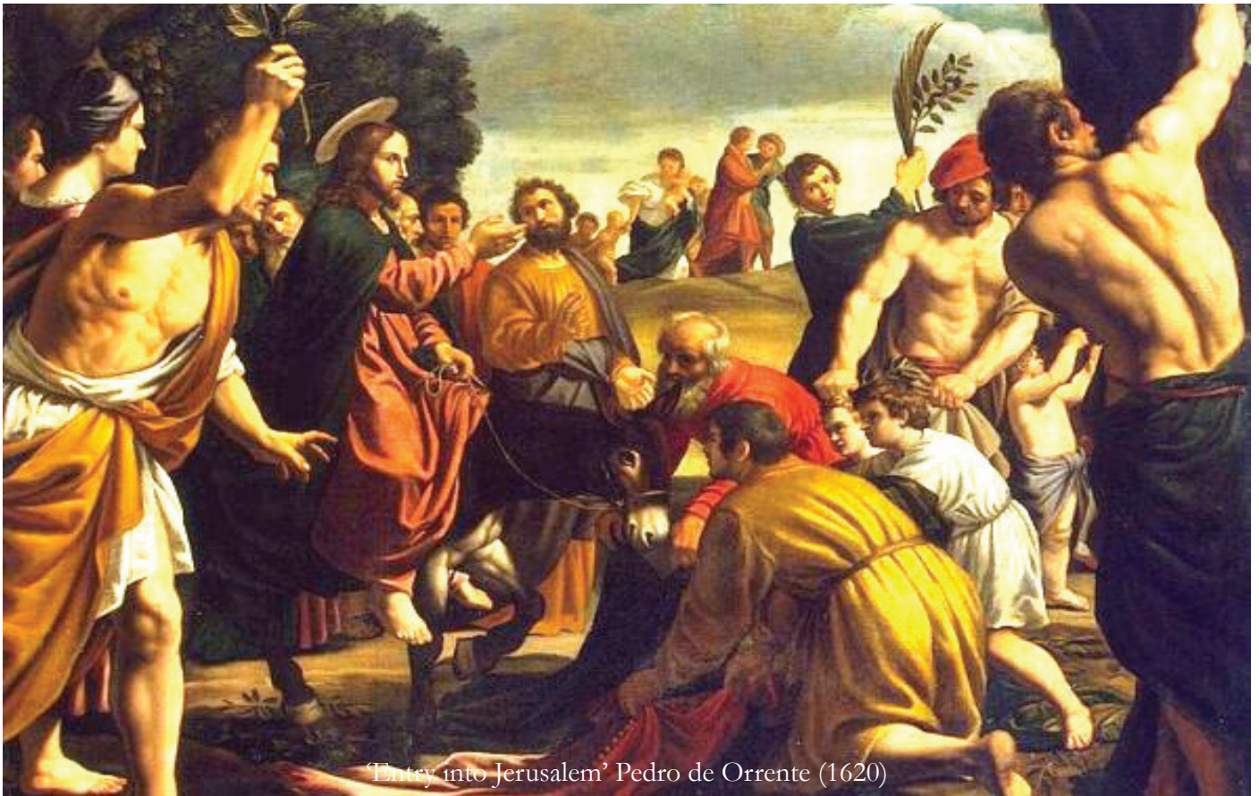
'Entry into Jerusalem' Pedro de Orrente (1620)