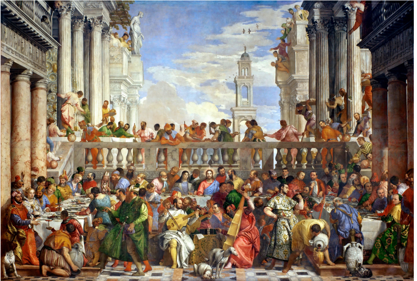
The Wedding Feast at Cana by Veronese, circa 1563.

Diocese of Melbourne – Anglican Church of Australia Parish Church of the City since 1846