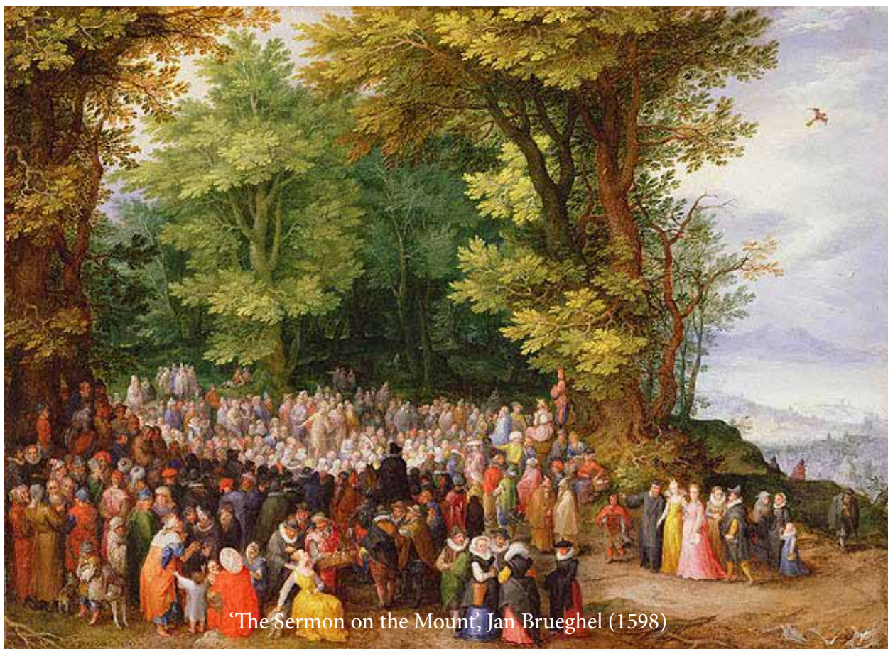
'The Sermon on the Mount', Jan Brueghel (1598)