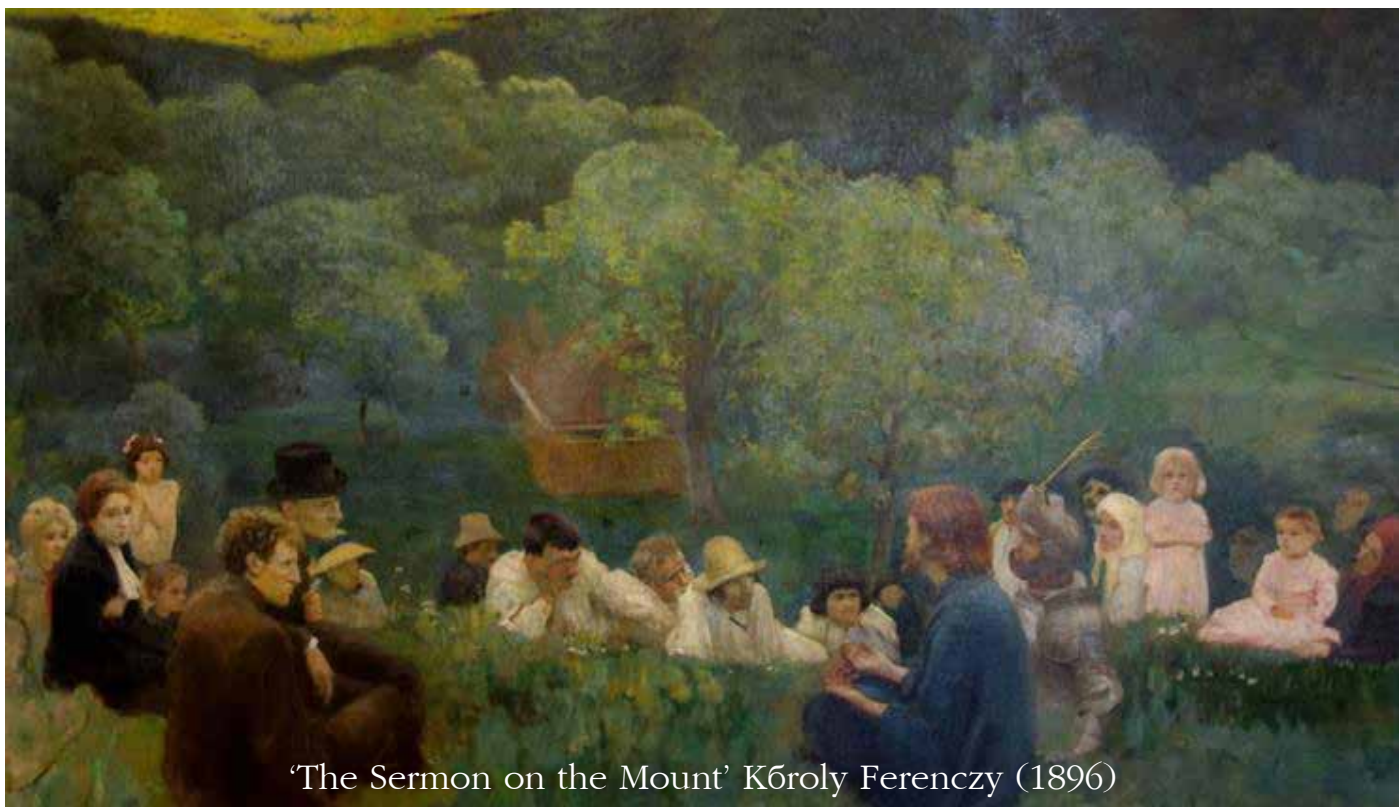
'The Sermon on the Mount' Károly Ferenczy (1896)