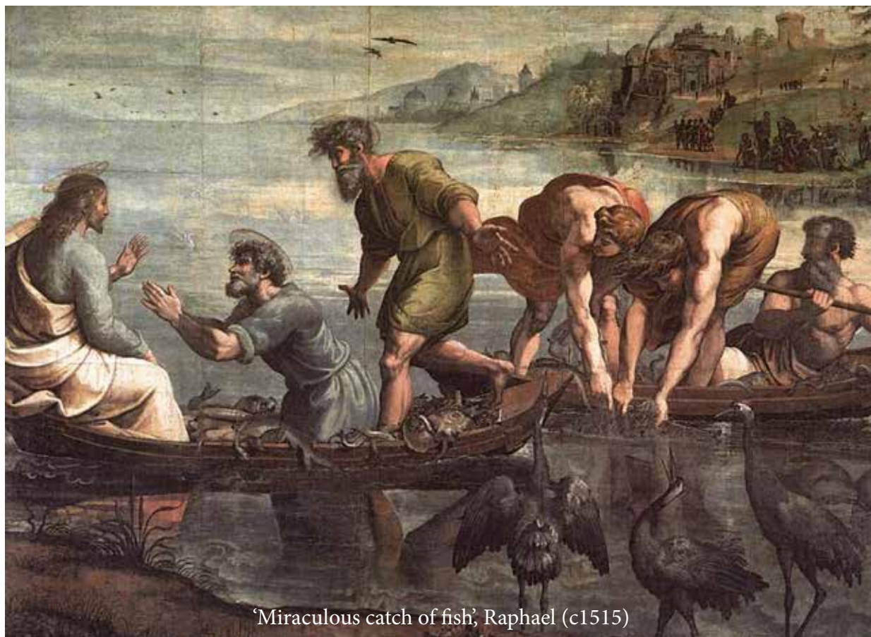
'Miraculous catch of fish', Raphael (c1515)

Diocese of Melbourne - Anglican Church of Australia Parish Church of the City since 1847