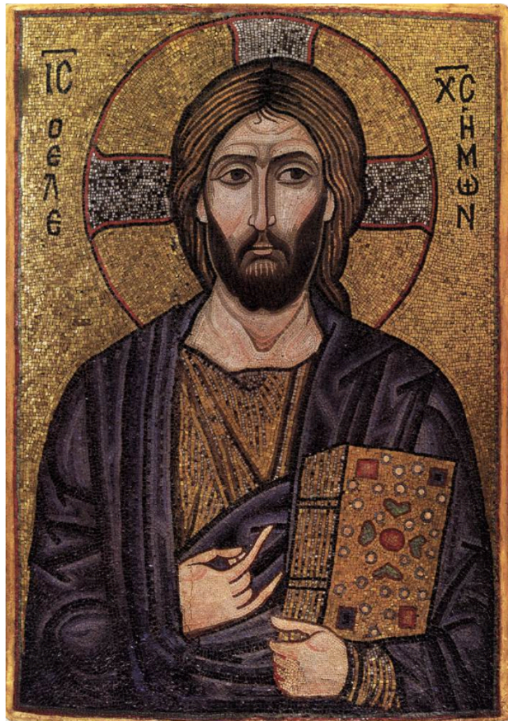
Byzantine mosaic, Salvator Mundi (c. 1100-1150)

Diocese of Melbourne - Anglican Church of Australia Parish Church of the City since 1846