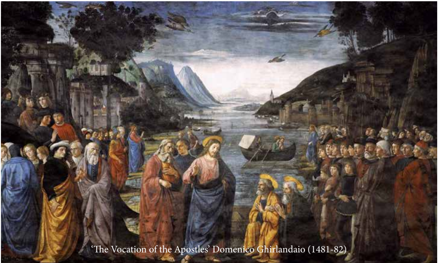
'The Vocation of the Apostles' Domenico Ghirlandaio (1481-82)