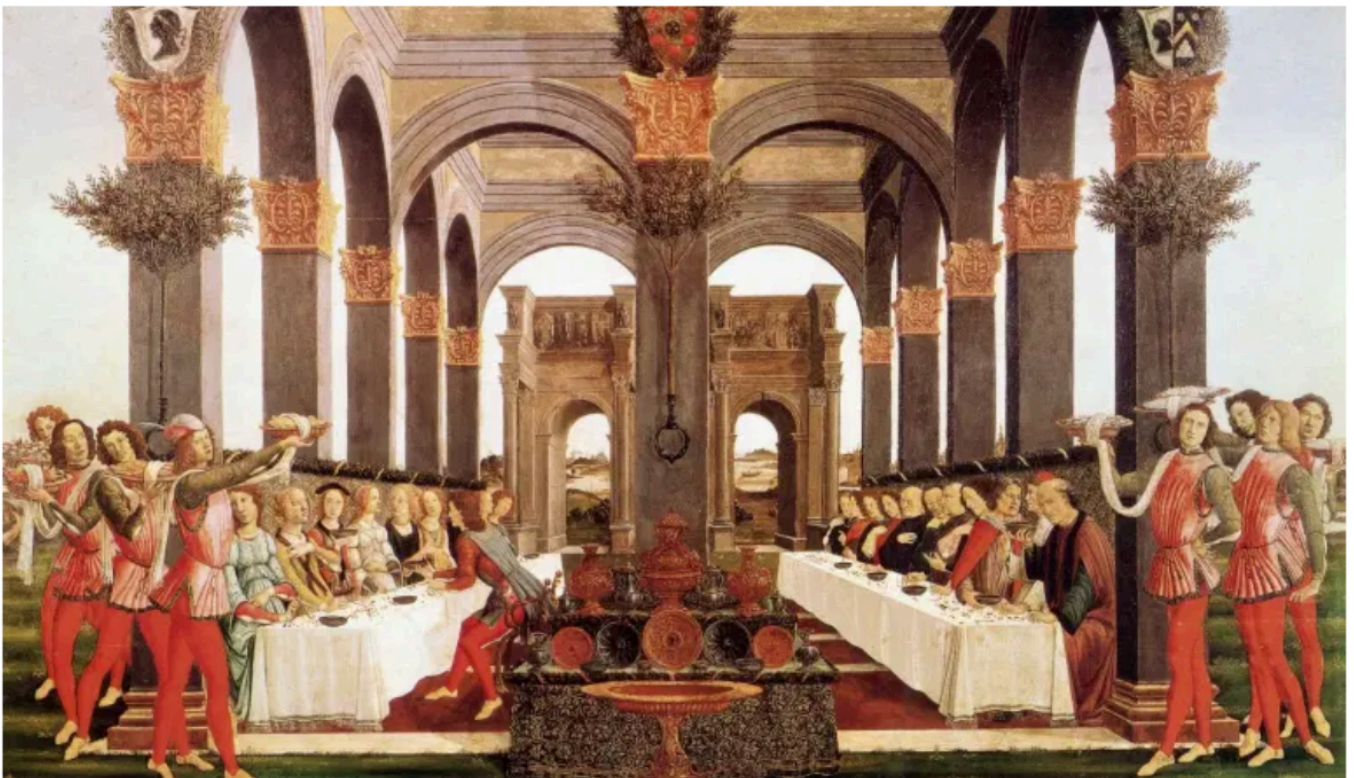
Sandro Botticelli, "The Wedding Feast" (1483)

Diocese of Melbourne - Anglican Church of Australia Parish Church of the City since 1846