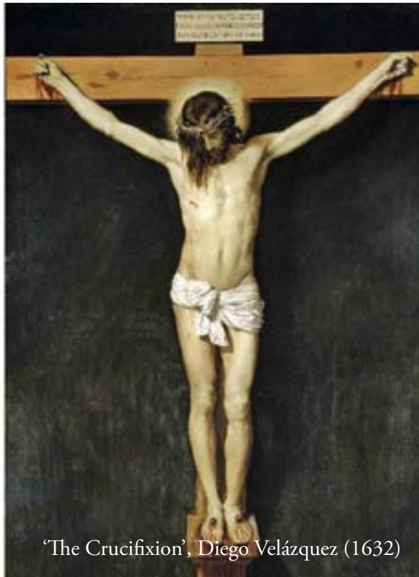
'The Crucifixion', Diego Velázquez (1632)

Diocese of Melbourne - Anglican Church of Australia Parish Church of the City since 1846