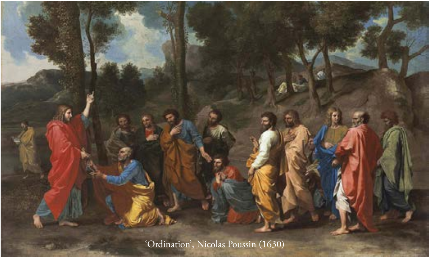
'Ordination', Nicolas Poussin (1630)

Diocese of Melbourne - Anglican Church of Australia Parish Church of the City since 1846