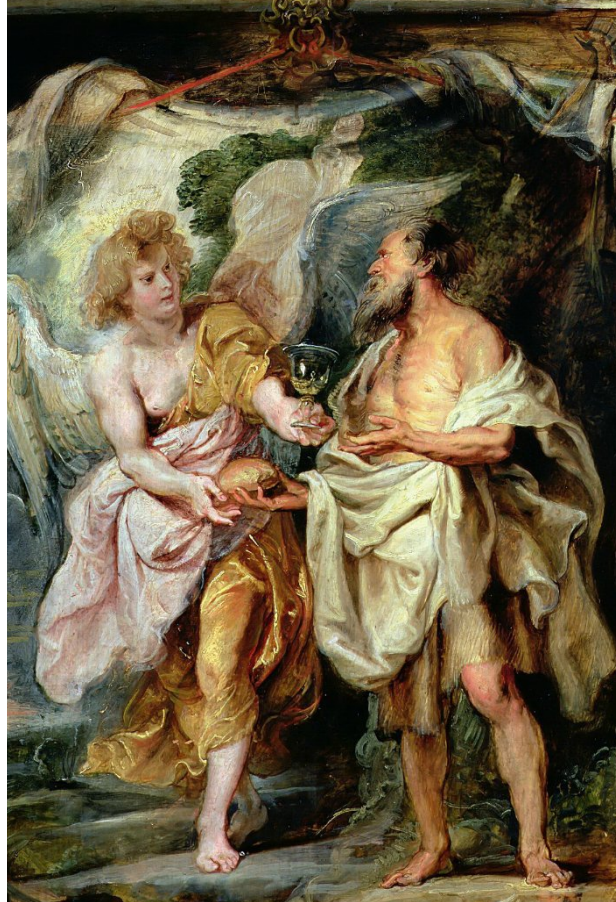
Rubens "Elijah Receiving Bread and Water from an Angel" (1628)

Diocese of Melbourne - Anglican Church of Australia Parish Church of the City since 1846