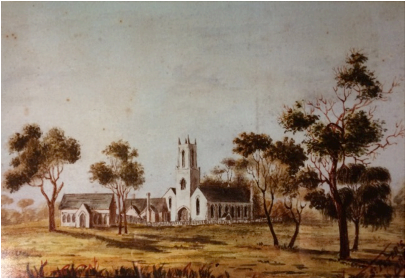
Charles Norton, "St Peter's in the Bush" (1850)

Diocese of Melbourne - Anglican Church of Australia Parish Church of the City since 1846