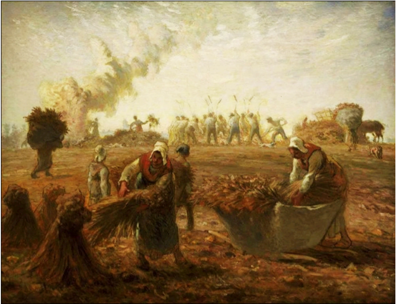
Millet, Jean-Francois, "Buckwheat Harvest, Summer" (1868-1874)

Diocese of Melbourne - Anglican Church of Australia Parish Church of the City since 1846