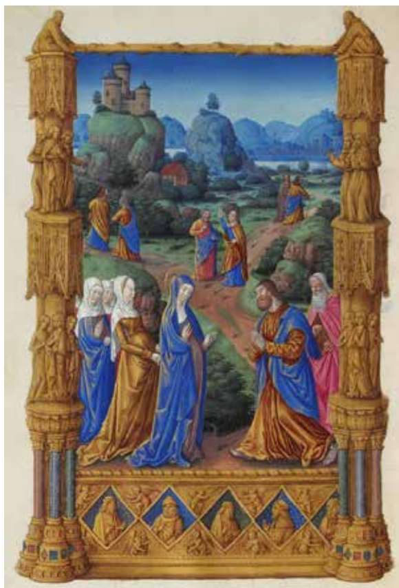
Illumination, Les Très Riches Heures du duc de Berry "The Apostles Going Forth to Preach" (c. 1412-16)

Diocese of Melbourne - Anglican Church of Australia Parish Church of the City since 1846