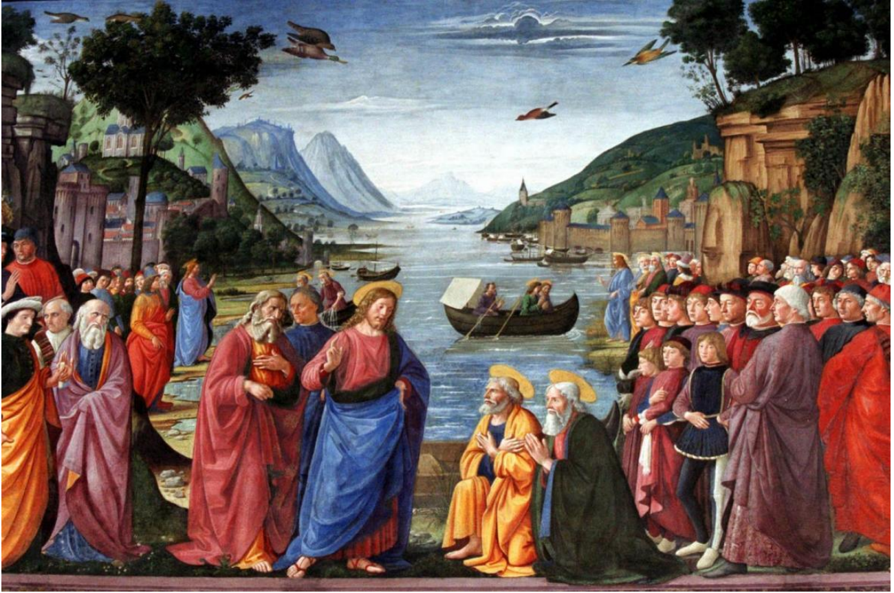
Domenico Ghirlandaio (1481–1482) Vocation of the Apostles

Diocese of Melbourne - Anglican Church of Australia Parish Church of the City since 1846