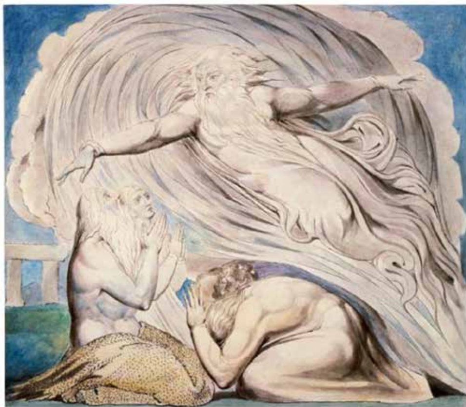
William Blake, "The Lord Answering Job Out of the Whirlwind" (c. 1810)