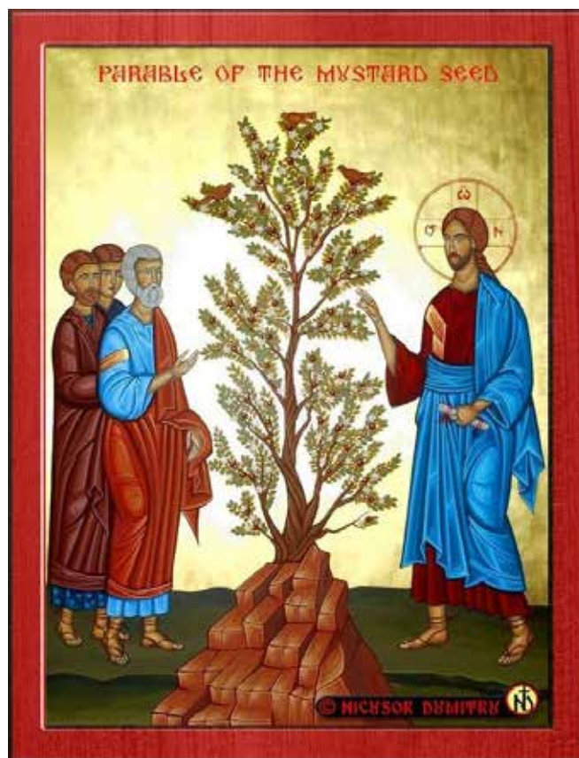
“Parable of the Mustard Seed” St Luke Orthodox School of the Seventy