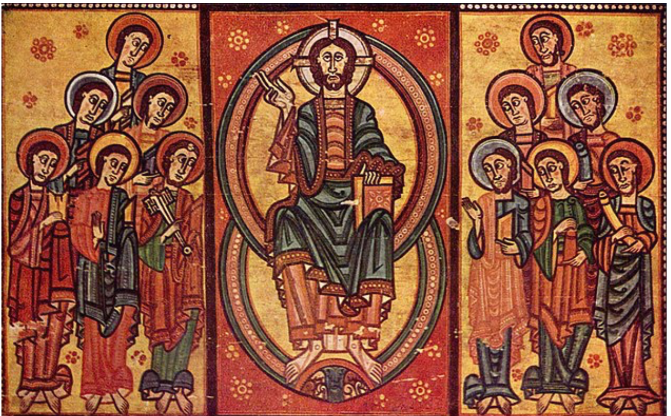
“Jesus and the Apostles” altar frontal from La Seu d'Urgell (12 th century)

Diocese of Melbourne - Anglican Church of Australia Parish Church of the City since 1846