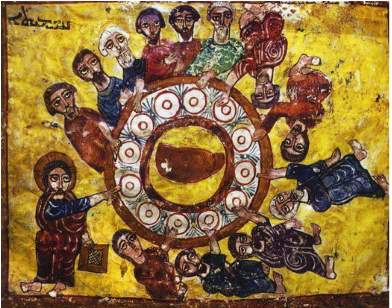
The Last Supper – illumination from a Syriac Lectionary (12 th Century)

Diocese of Melbourne - Anglican Church of Australia Parish Church of the City since 1846