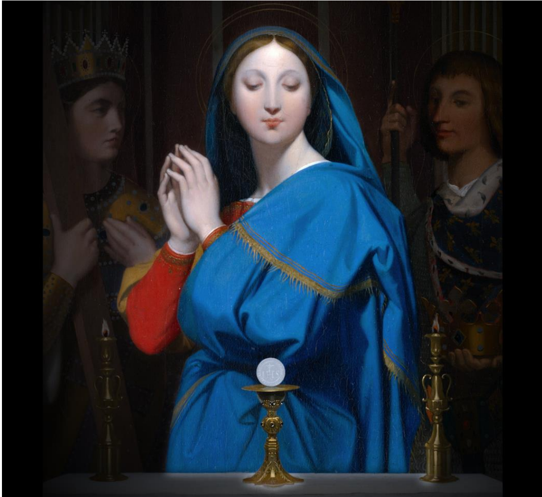
Jean-Auguste Dominique Ingres (1780 – 1867) The Virgin Adoring the Eucharist

Diocese of Melbourne – Anglican Church of Australia Parish Church of the City since 1846