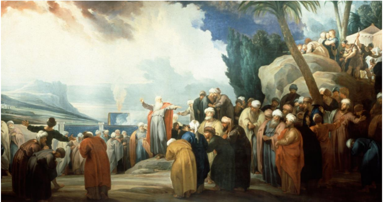
Jacob de Wit (1695 – 1754) Moses elects the Council of Seventy Elders

Diocese of Melbourne – Anglican Church of Australia Parish Church of the City since 1846