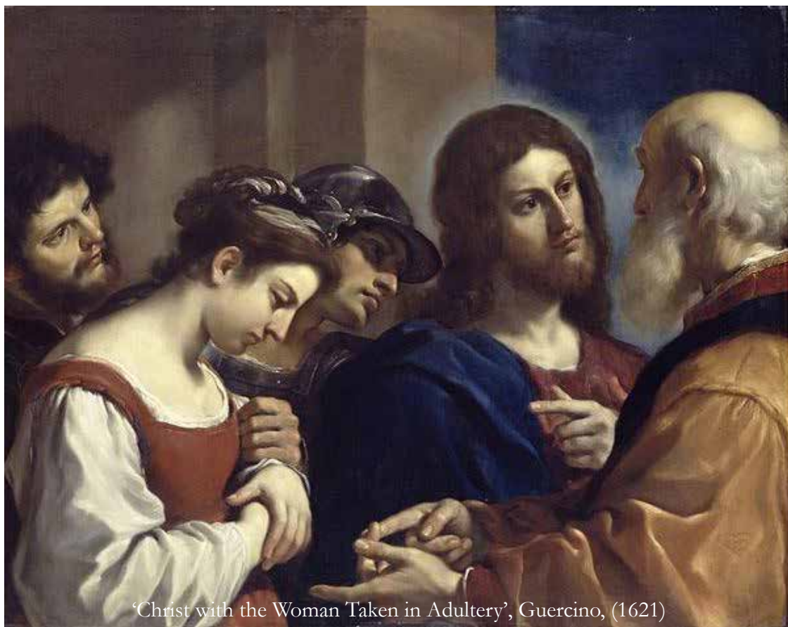
'Christ with the Woman Taken in Adultery', Guercino, (1621)

Diocese of Melbourne - Anglican Church of Australia Parish Church of the City since 1846