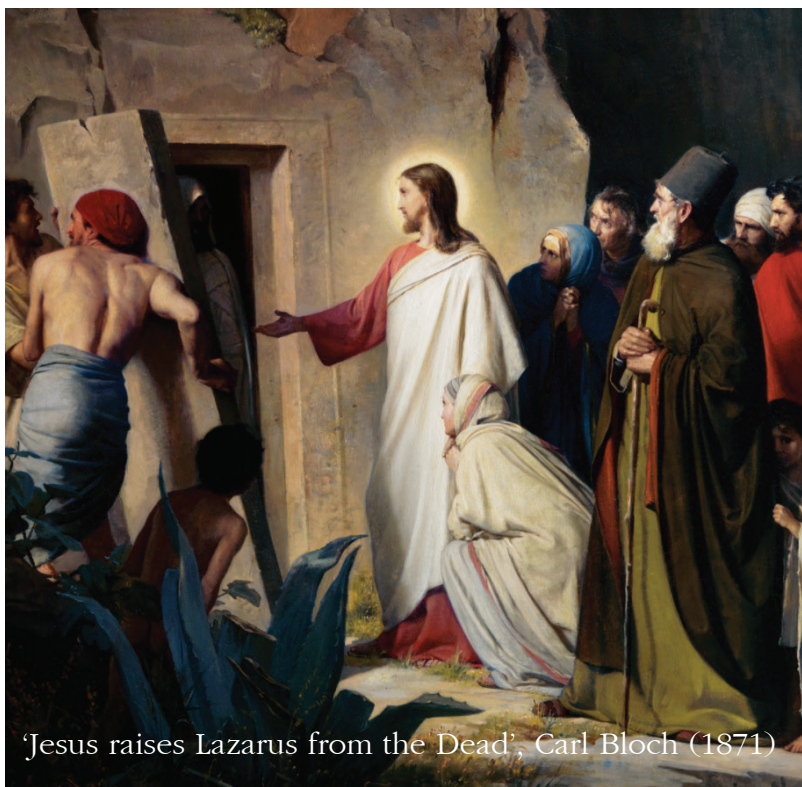
'Jesus raises Lazarus from the Dead', Carl Bloch (1871)

Diocese of Melbourne - Anglican Church of Australia Parish Church of the City since 1846