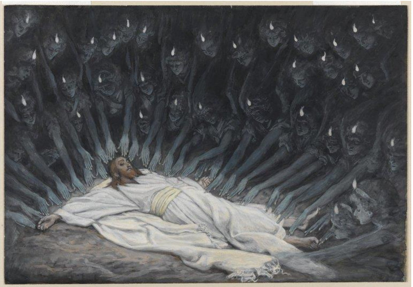
James Tissot (1836 – 1902) Jesus Ministered to by Angels (Jésus assisté par les anges)

Diocese of Melbourne - Anglican Church of Australia Parish Church of the City since 1846