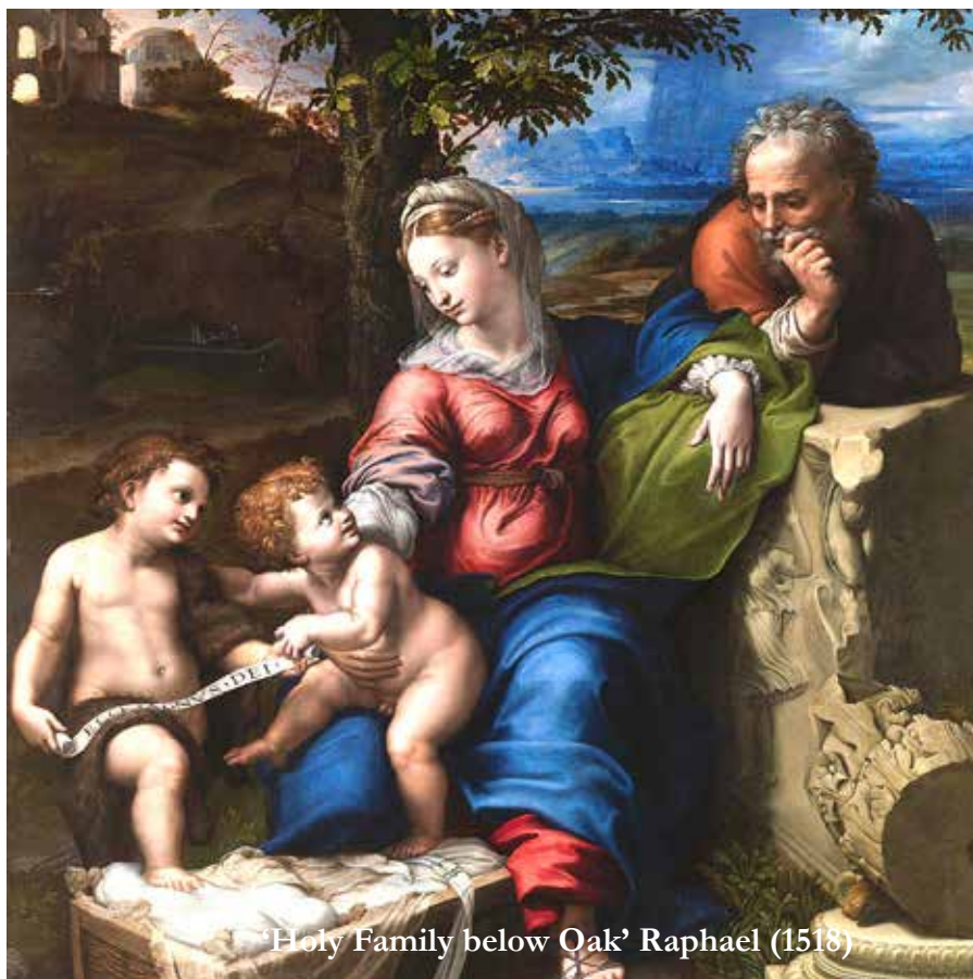
'Holy Family below Oak' Raphael (1518)