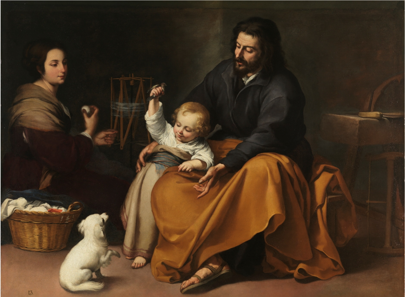
Bartolomé Esteban Murillo (1617 – 1682) The Holy Family with a Little Bird

Diocese of Melbourne – Anglican Church of Australia Parish Church of the City since 1846