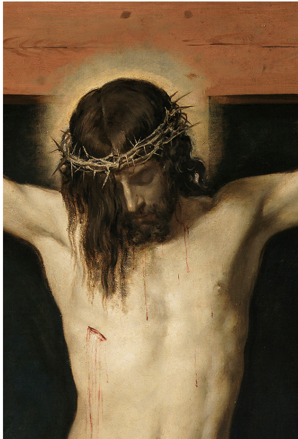
“Christ Crucified” (detail) by Diego Rodríguez de Silva y Velázquez (1599 – 1660)

Diocese of Melbourne - Anglican Church of Australia Parish Church of the City since 1846