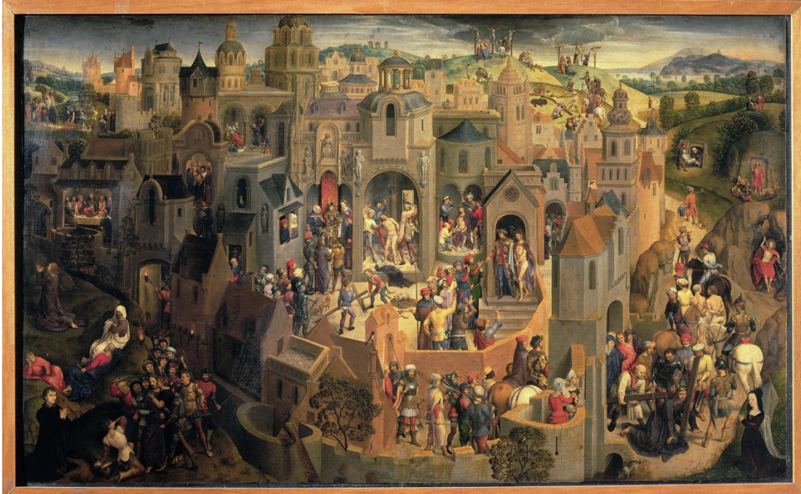
Scenes from the passion of christ, painting by hans memling (1433-1494), between 1470 and 1471, oil on panel

Diocese of Melbourne - Anglican Church of Australia Parish Church of the City since 1846