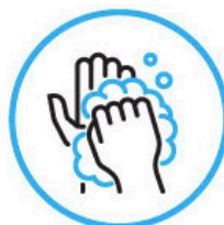
Sanitising and washing hands