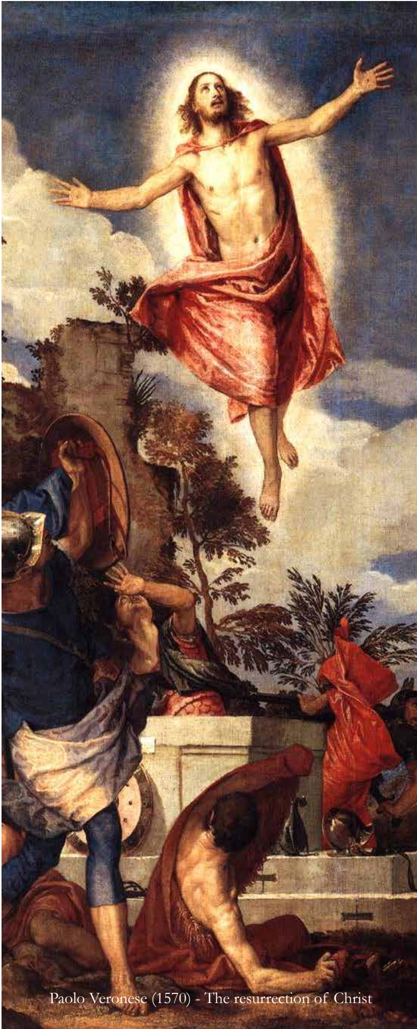
Paolo Veronese (1570) - The resurrection of Christ