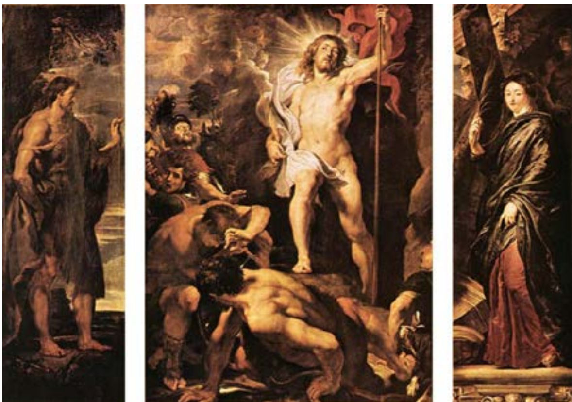
The Resurrection of Christ in Detail, Peter Paul Rubens (1612)

Diocese of Melbourne - Anglican Church of Australia Parish Church of the City since 1846