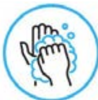
Sanitising and washing hands