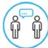
Please be kind and care for one another in these stressful times of change