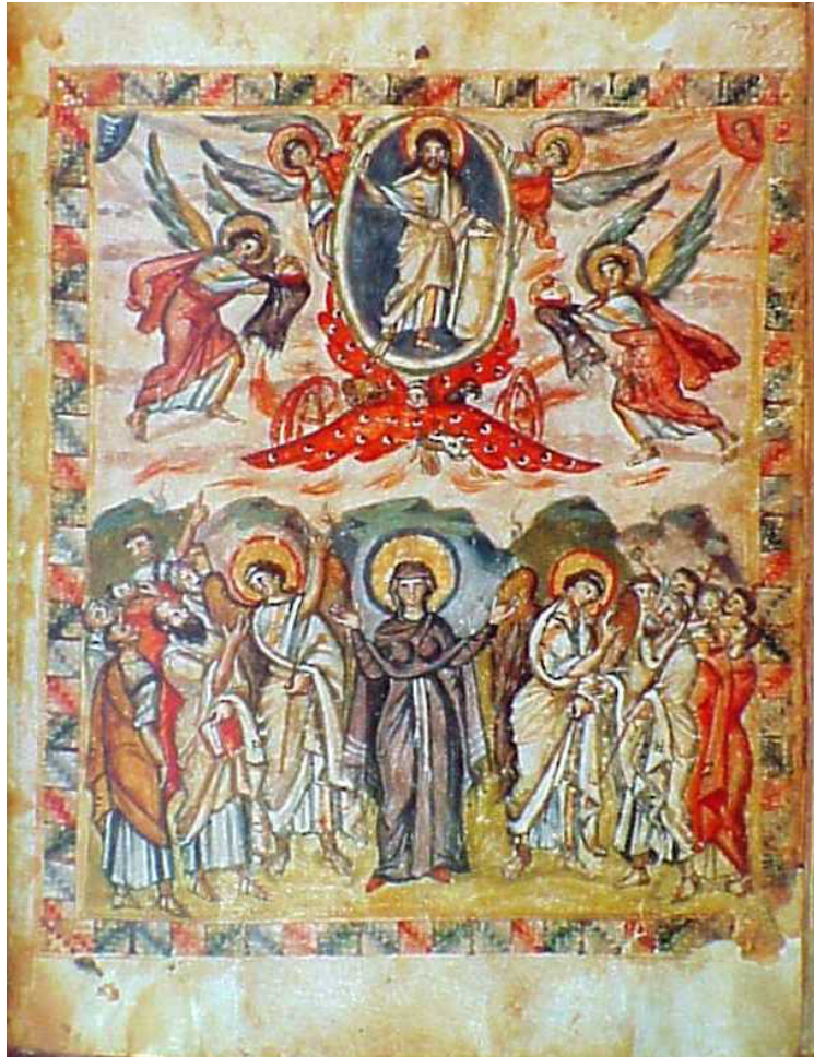
“The Ascension of Christ,” illumination from Rabbula Gospels (6 th Century)

Diocese of Melbourne - Anglican Church of Australia Parish Church of the City since 1846