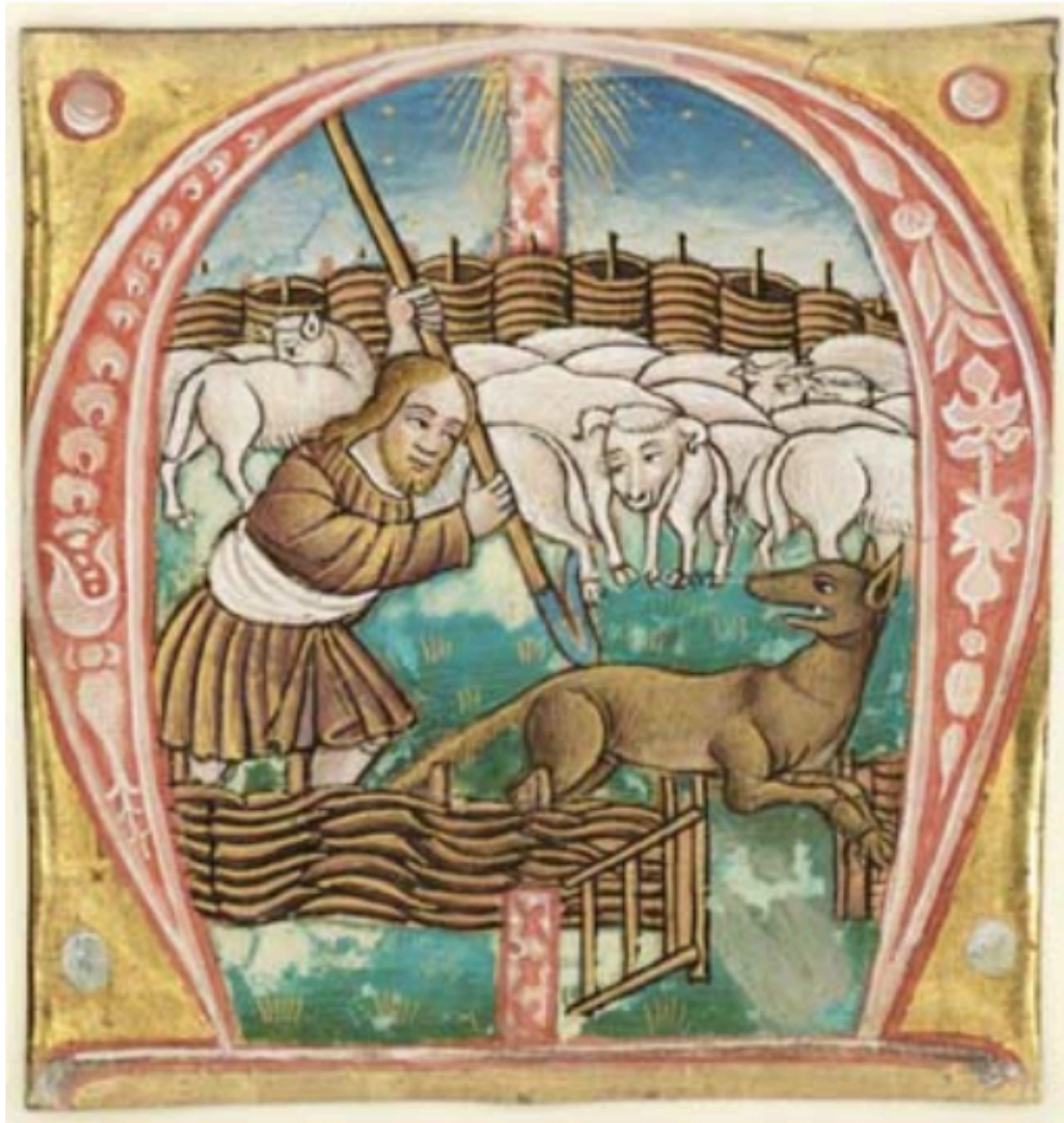
Christ the Good Shepherd, medieval manuscript illumination

Diocese of Melbourne - Anglican Church of Australia Parish Church of the City since 1846