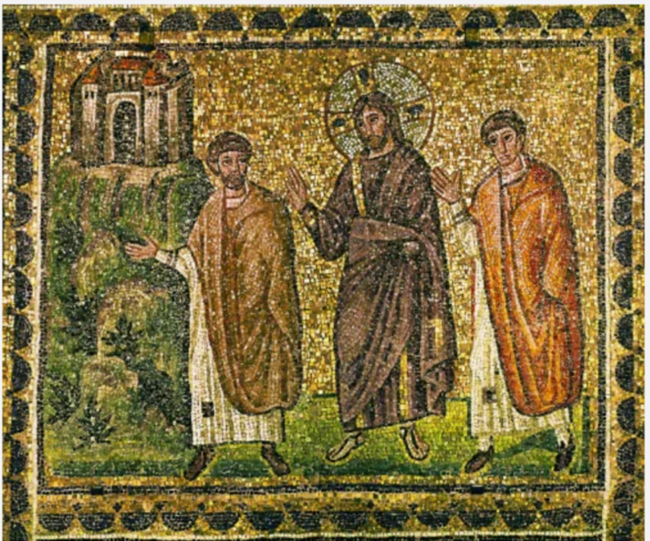
Christ appears to the Apostles on the road to Emmaus. Mosaic (6th century)

Diocese of Melbourne - Anglican Church of Australia Parish Church of the City since 1846