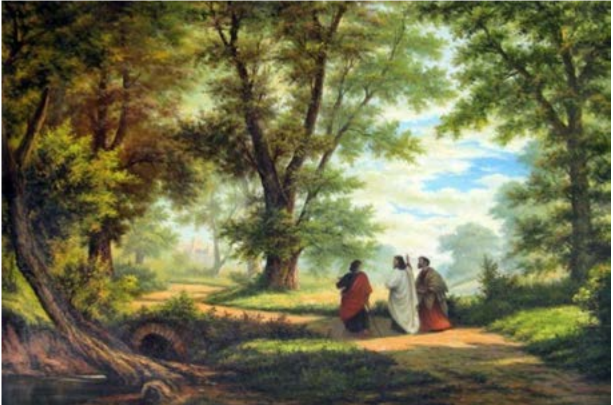
'The Road to Emmaus', Robert Zund (1877)

Diocese of Melbourne - Anglican Church of Australia Parish Church of the City since 1846