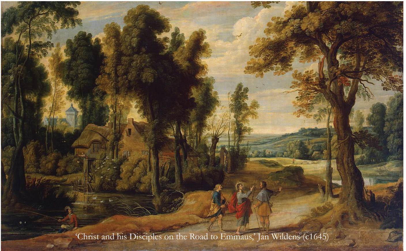
'Christ and his Disciples on the Road to Emmaus,' Jan Wildens (c1645)