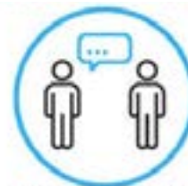
Please be kind and care for one another in these stressful times of change