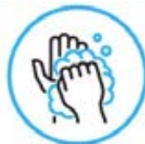
Sanitising and washing hands