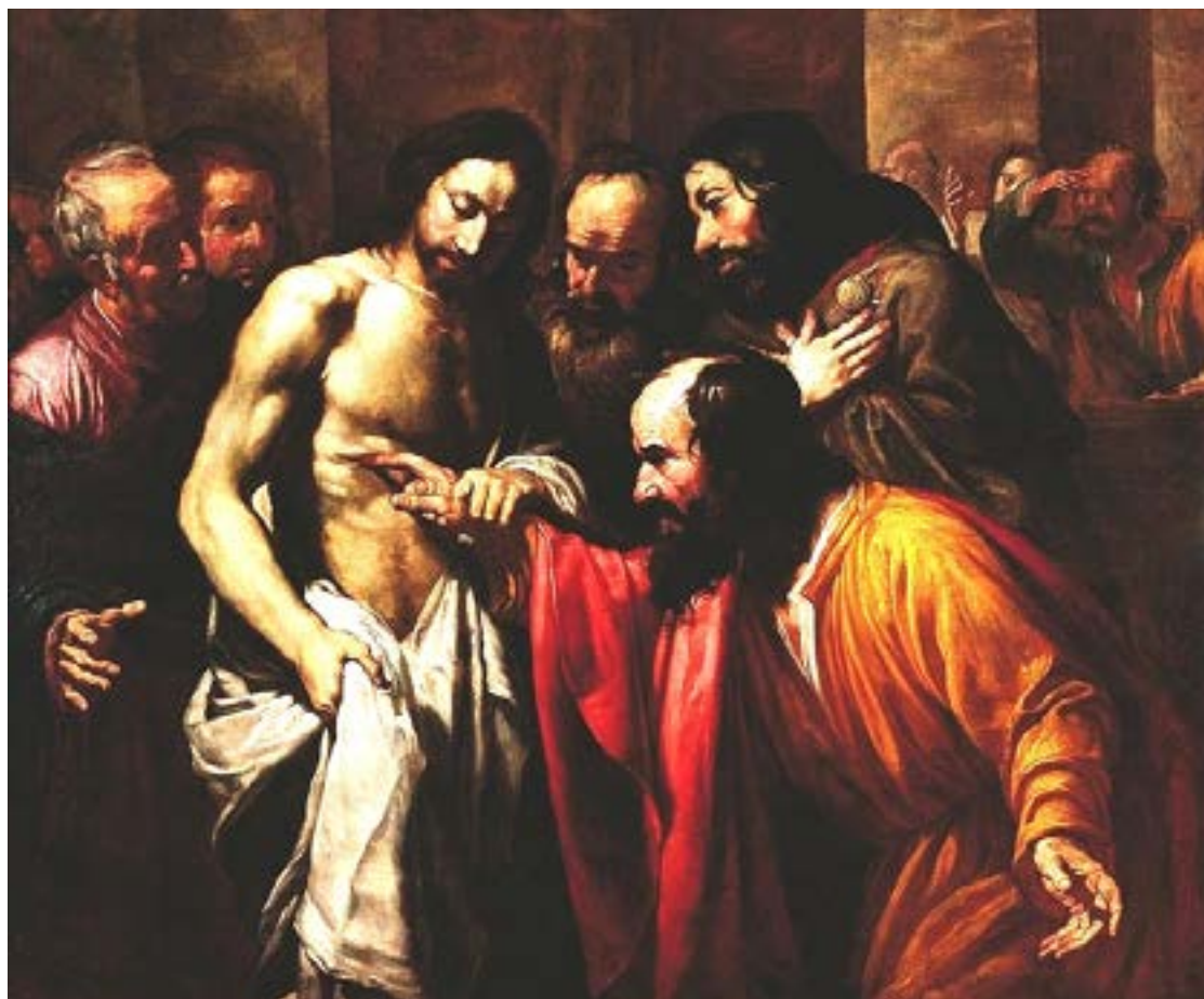
'Doubting Thomas', Giovanni Serodine' (1620)

Diocese of Melbourne - Anglican Church of Australia Parish Church of the City since 1846