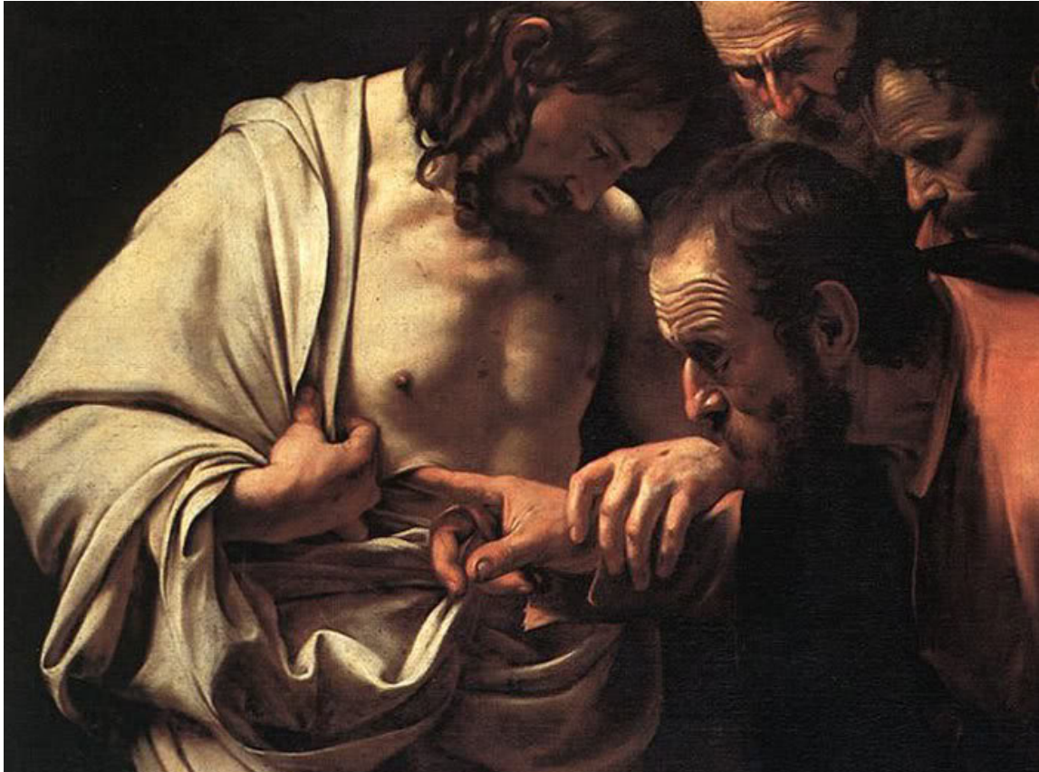
The Incredulity of Saint Thomas by Michelangelo da Caravaggio (1571 – 1610)