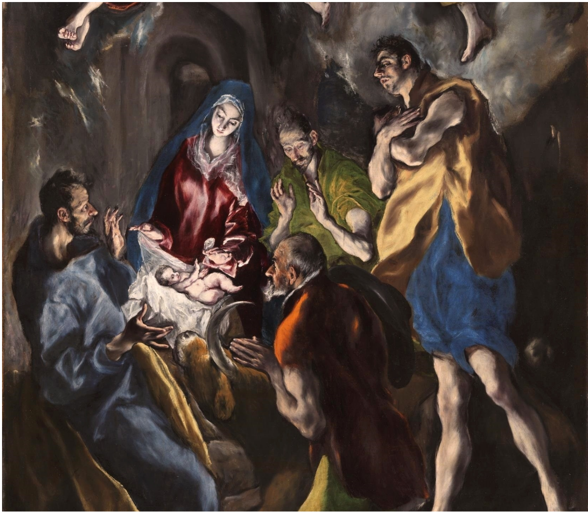
El Greco (1541—1614) Adoration of the Shepherds